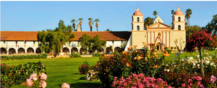
Santa Barbara Mission

Oct. 15 th – Today we journey north along El Camino Real, “The Royal Highway” along which the 21 missions were built. Our first stop is the San Juan Capistrano Mission, known for its mysterious arrival of the swallows on March 19 th . every year. Special indeed! Enjoy the peaceful serenity of this holy place. Venturing north (pun intended), we will enter the historic doors of the San Buenaventura Mission. In its time, this was a very prosperous mission with exotic crops such as bananas, sugar cane and coconuts. If time, weather and traffic cooperate we will do our best to include stops at the San Gabriel and/or San Fernando Missions in the greater Los Angeles area as well on this day. Our accommodations for the next two nights are in Santa Barbara