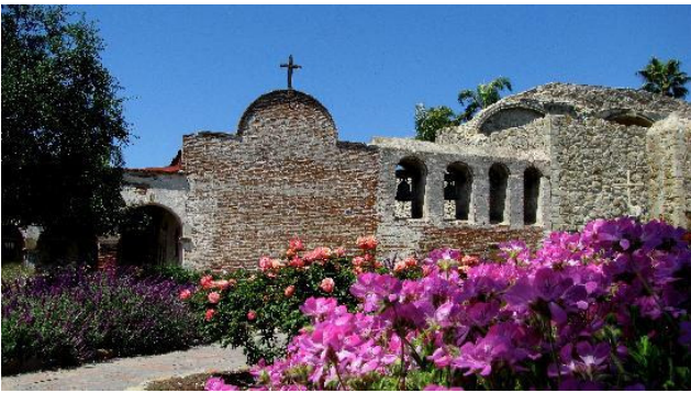
San Juan Capistrano