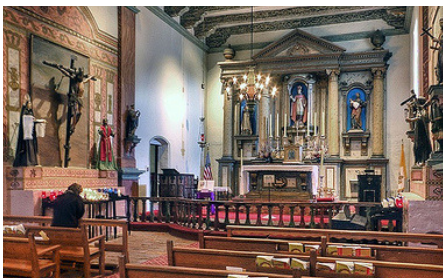
Altar in San Buenaventura