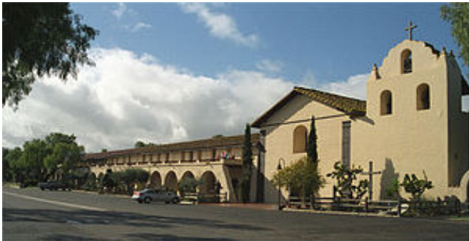
Santa Inez Mission

Oct. 16 th – Have your cameras ready as we approach the majestic Santa Barbara Mission, the Queen of the Missions. Noted for its Roman temple façade and magnificent views, her history is fascinating and will keep you spell bound. Then relax on a scenic drive around Cachuma Lake, heading to Solvang a jewel of a town with a Danish heritage, known for its delicious pastries. There will be time for browsing and shopping. We’ll visit the Santa Inez Mission, a pleasant mix of charming simplicity and wandering hillsides. Let the quiet peace permeate you as you stroll along the walkways and grounds