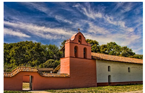
La Purisima Concepcion

Oct. 17 th –Our journey this morning, takes us past some majestic horse breeding farms enroute to the La Purisima Concepcion Mission. As a 966 acre State Historic Park, La Purisima has been restored to present a genuine look at a “working mission”, complete with animals, tallow works, weavery, and even an olive crusher. Our next destination is the San Luis Obispo Mission. This was the first mission to make fire resistant red clay roof tiles, now a common sight all over California and is the halfway point in the entire chain of missions. Comfortable lodging in Monterey promises a restful evening.