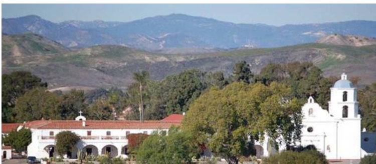
Mission San Luis Rey

Oct. 14 th - A special highlight of this week comes early as we visit the Prince of Peace Abbey in Oceanside, sister abbey to St. Meinrad. Today we enjoy the grandeur of the San Luis Rey Mission, the “King of the Missions”. Get ready for the city sights of San Diego with a trip to Coronado Island to see the world famous Hotel del, driving through Little Italy, the historic Gaslamp district, and other points of interest.