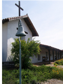
San Francisco Solano

Missions San Diego, San Luis Rey, San Juan Capistrano, San Buenaventura, Santa Barbara, Santa Ines, La Purisima Concepcion, San Luis Obispo, San Carlos Borromeo, San Francisco Solano, Mission Dolores