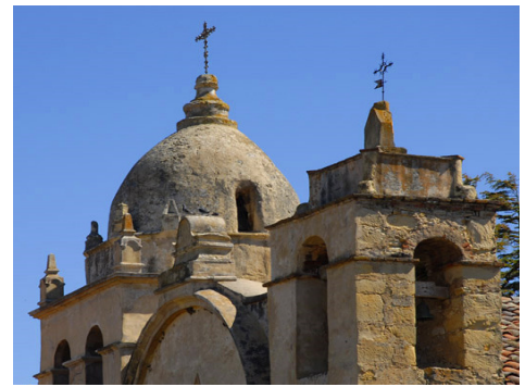
San Carlos Borromeo Mission

Oct. 18 th – Today’s special highlight is the San Carlos Borromeo de Carmelo Mission, believed by many to be the most beautiful of all missions, and noted as the most authentic restoration. You will have time to shop and browse in the quaint city of Monterey and Clint Eastwood’s hometown of Carmel. We head on to San Francisco for our accommodations over the next two nights.