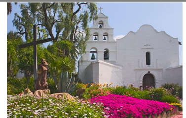
Mission San Diego

Oct. 13 th – Flying into San Diego, the warm sunshine welcomes you to the city of the very first California mission founded by Fr. Junipero Serra. A glistening white structure on a hillside sits Mission San Diego de Alcala, known as the Mother of the Missions, what a glorious start to your Pilgrimage! An authentic Mexican dinner in Old Town is planned for your enjoyment with lodging for the next 2 nights in town.