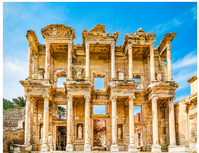
Library of Celsus ~ Ephesus

(B) ~ Breakfast (L) ~ Lunch (D) ~ Dinner